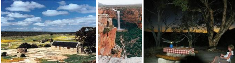
Karukareb (recommended for the summer months)